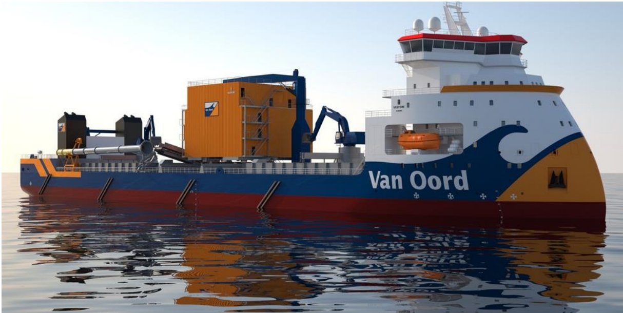
Nordnes – Call sign: PHOG